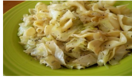
Cabbage & Noodles